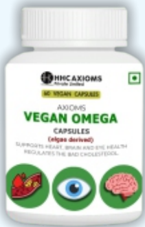
Vegan Omega Capsule