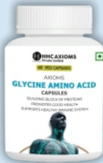
Glycine Amino Acid Capsule