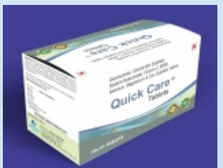
Quick Care Tablets

ALA, Vitamin B12, Folic Acid, Vitamin B1, & Vitamin B6