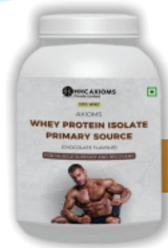
Axioms whey protein isolate