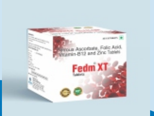
Fedm XT Tablets

Ginseng, Multivitamin & Multimineral Capsules