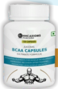
Axioms BCAA Capsule