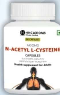
N-Acetyl L-Cysteine Capsule