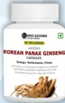
Korean Panax Ginseng Capsule